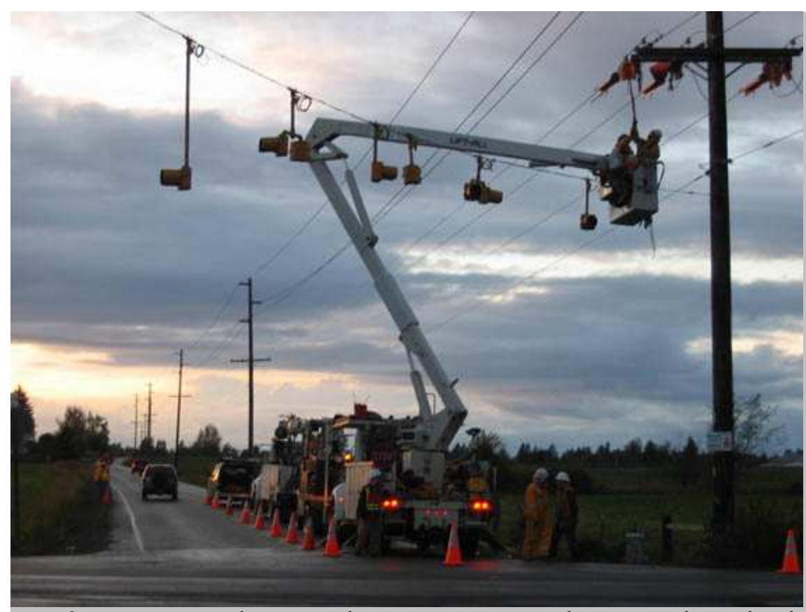
Here's Puget Sound Energy having to reroute the power lines back after the fish roundabout roundabout was buried under the water table + Add this to our bill along with City of Enumclaw Water Dept. forced to move their lines + Qwest + Comcast, et al